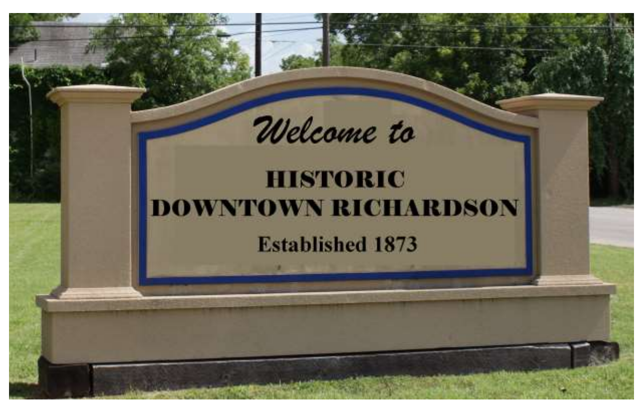
Prototype Downtown Richardson Identifying Sign (Modeled after a sign erected in Denison, Texas

3. IDENTIFYING BANNERS. Identifying banners, such as the City already uses to announce upcoming events, could be displayed from poles alongside E. Main Street.