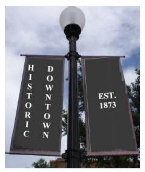
Prototype Identifying Banner (Modeled after banners displayed in Denison, Texas,)

3. IDENTIFYING BANNERS. Identifying banners, such as the City already uses to announce upcoming events, could be displayed from poles alongside E. Main Street.